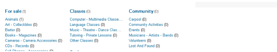
Figure 1: Classifieds Ads for College Student Freelancers