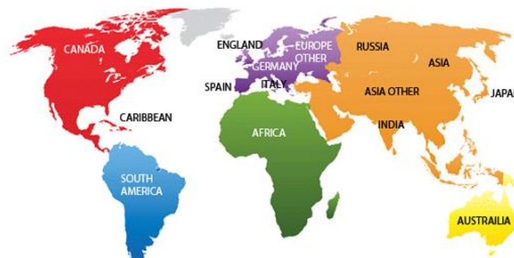
Figure 2: International College Registration

We've recently added an International section for the Claim UR College initiative! It works exactly the same as the US-based initiative. If you do not see your country please use the EuropeOther or AsiaOther links for submission purposes.