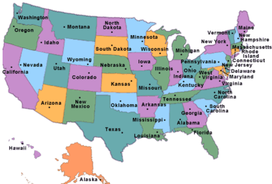
Figure 1: U.S. College Student Registration